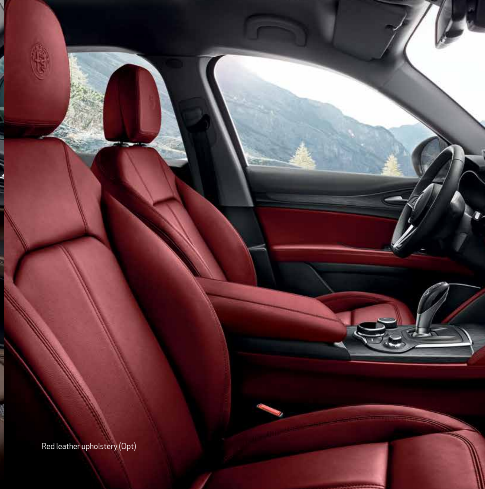
Red leather upholstery (Opt)