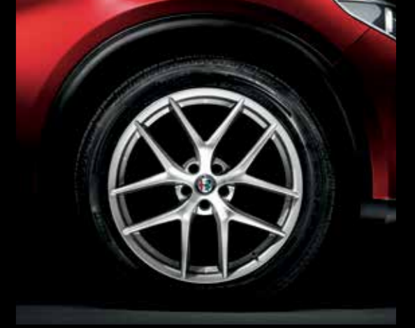
5A6 - 20" alloy wheels