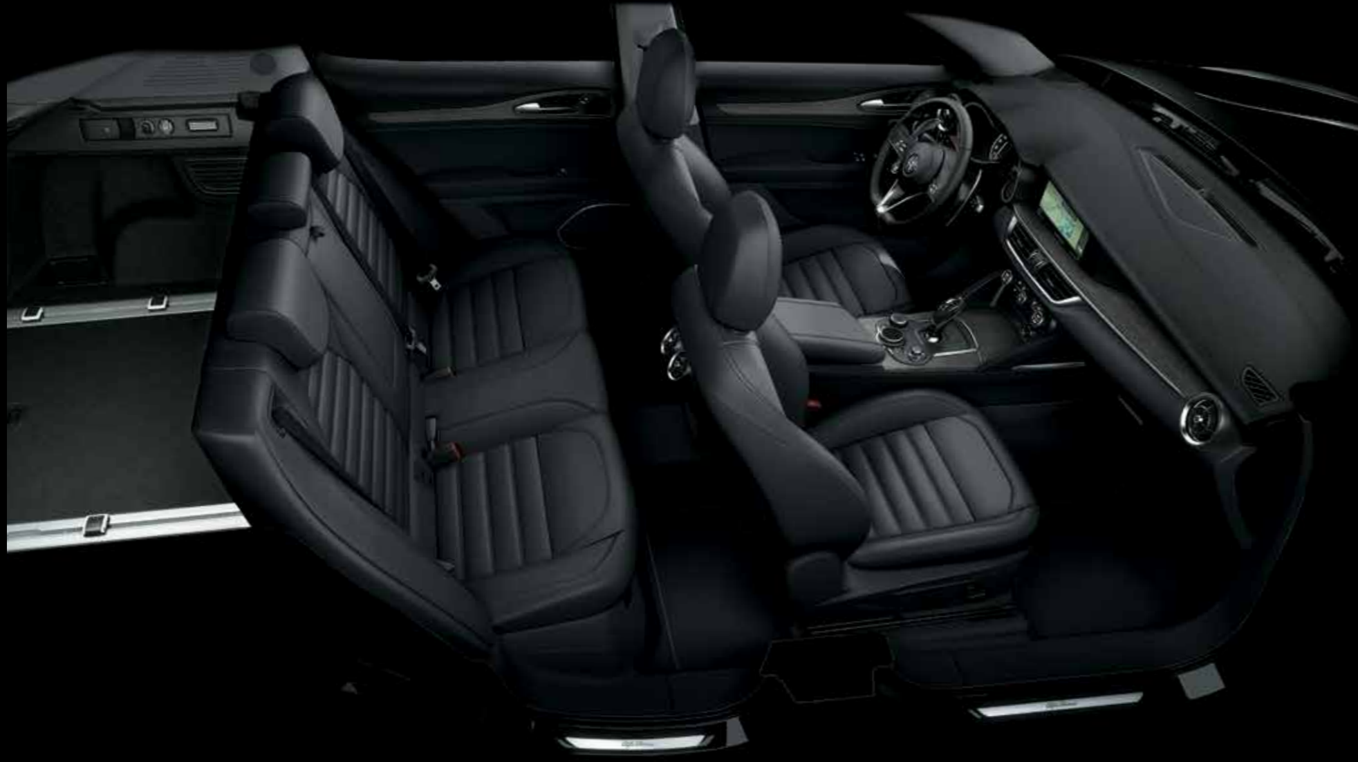
Black dashboard with grey oak wood - Black leather