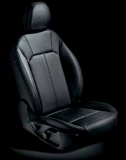
Black leather upholstery (Opt)