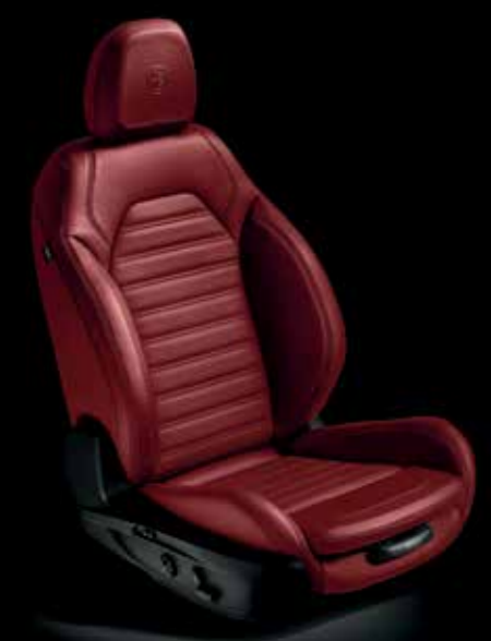
Red leather sports seats