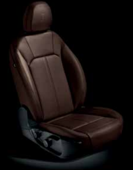
Chocolate leather upholstery (Opt)