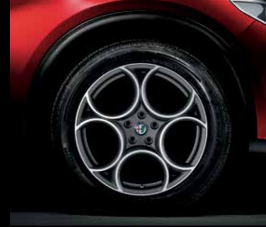
5EV - 19" sport alloy wheels