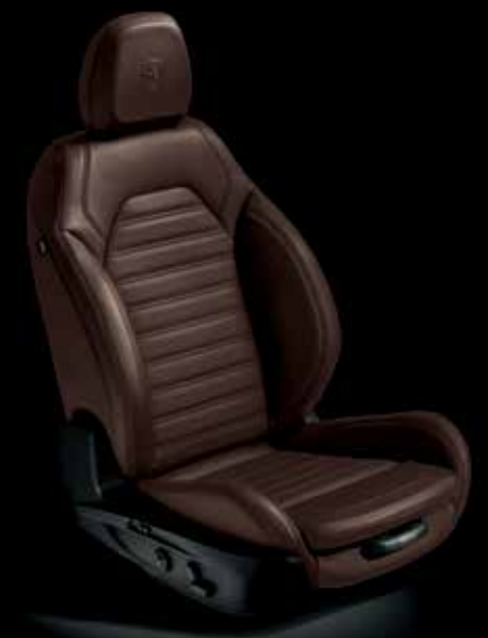
Chocolate leather sports seats