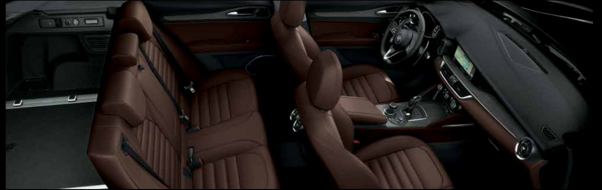
Chocolate leather dashboard with grey oak wood - Chocolate leather upholstery