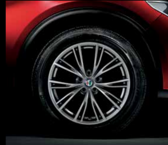
4WQ - 18" luxury alloy wheels