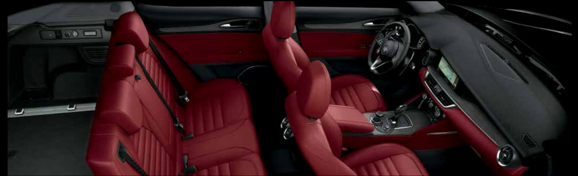
Red leather dashboard with grey oak wood - Red leather upholstery